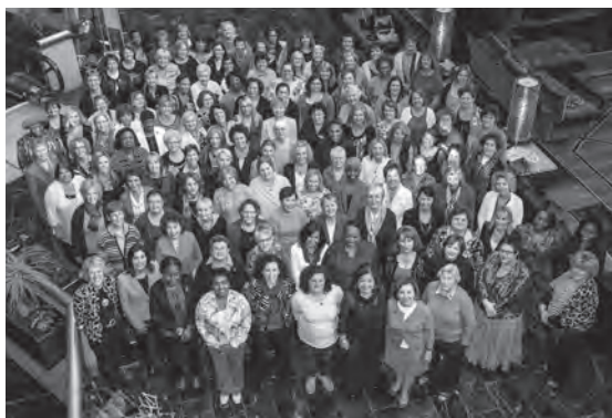
Breast Cancer Coalition Annual Advocate Summit- America's Charities