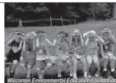
Wisconsin Environmental Education Foundation