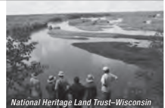
National Heritage Land Trust—Wisconsin

Provides neighborhood-based action and education programs that bring together citizens, businesses, and governments to ensure safe drinking water, pollution prevention, and resource conservation. www.cleanwaterfund.org