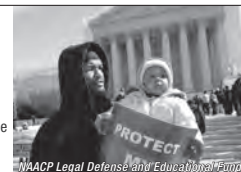
NAACP Legal Defense and Educational Fund

You may contribute to America's Charities itself or directly to the member organizations listed in this section. Designations to specific organizations go to those charities. General contributions to America's Charities are used to support the missions of its member organizations. www.charities.org