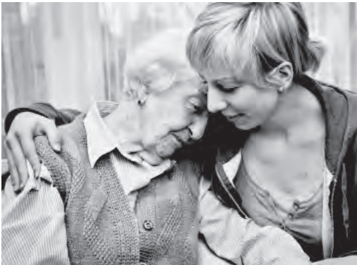
Daughter consoling Mother—Community Health Charities